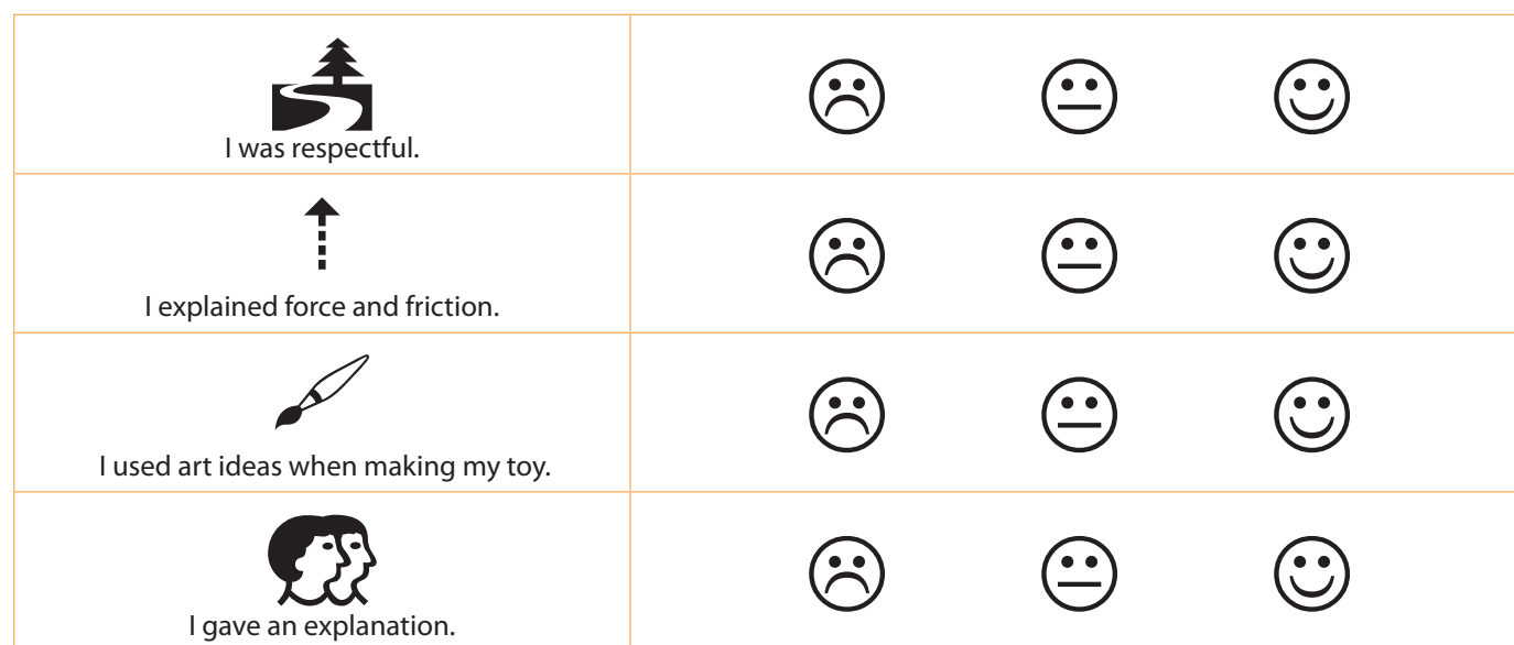
Table 3. Self-Assessment Rubric

"I was thinking of the question as the planting of a seed." . . . Thinking of questions as "seeds to thinking" rather than queries requiring answers is a major change in a teacher's teaching practice. If the question is a "seed," it is asked for a different purpose than receiving a correct answer; it is asked to stimulate thinking and feeling.